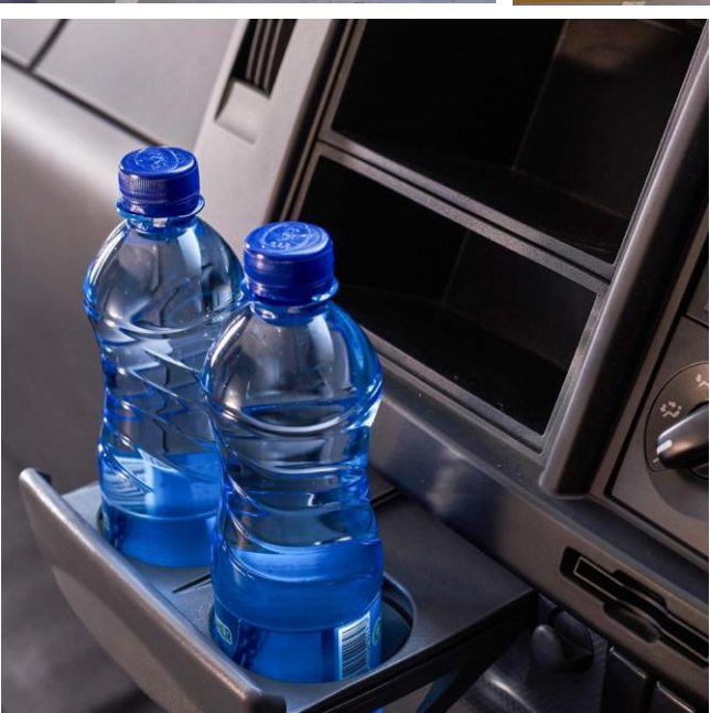
Cup holders Holds two cups or cans within easy reach of driver