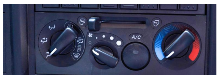
Air conditioner Cab atmosphere stays fresh and clean