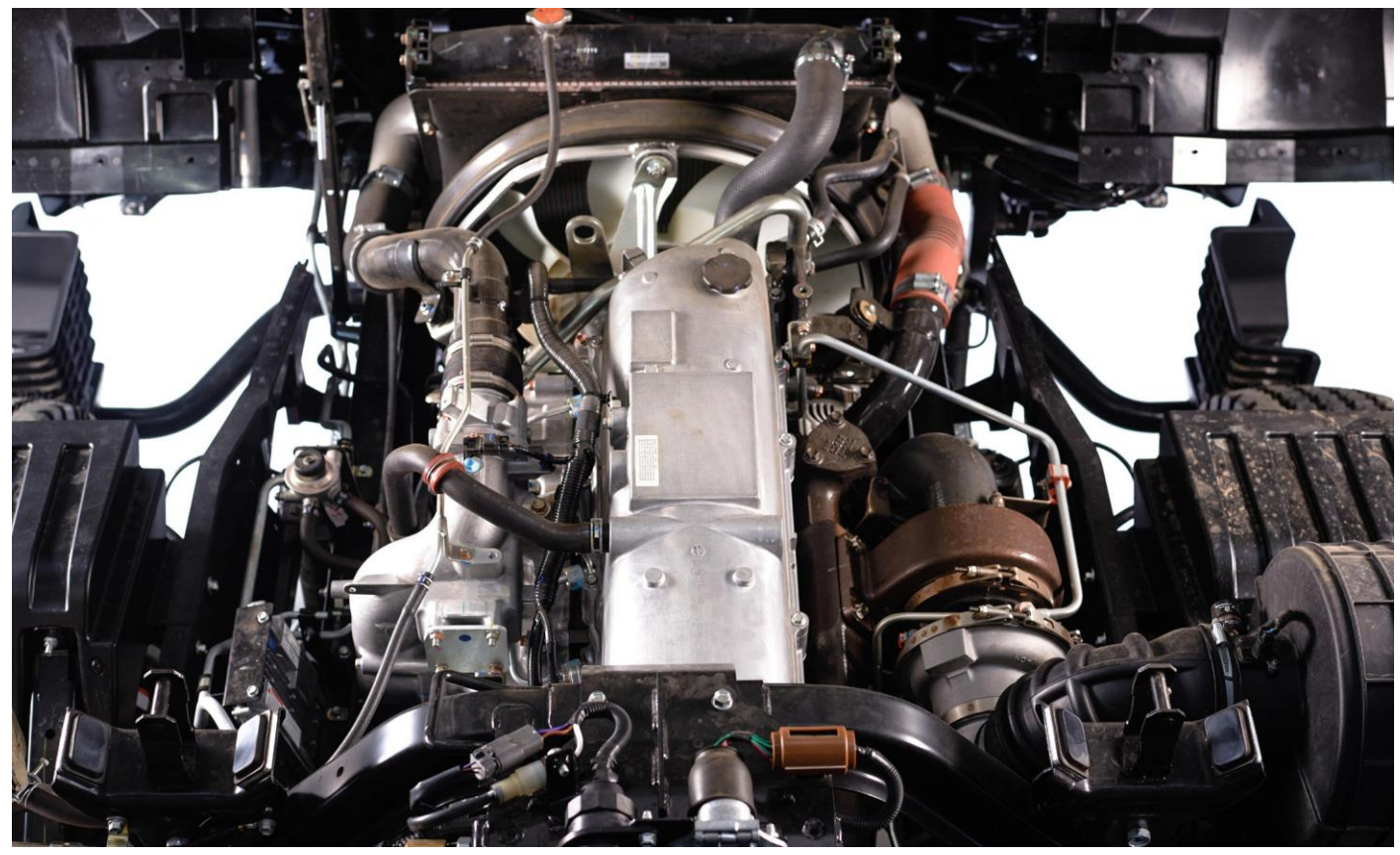
Easy on the environment and your pocketbook

Being environmentally friendly is not only at the core of ISUZU. The Prime Mover GXZ has reduced emissions and improved fuel efficiency thanks to the 6NX1-TCS diesel that packs several advanced technologies into a compact format producing 345hp.