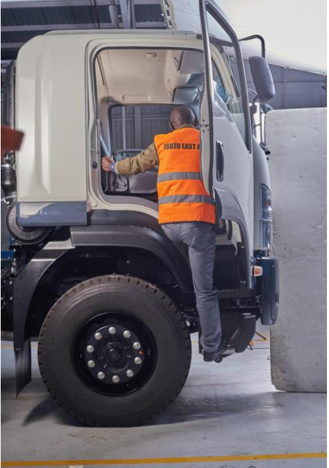
Easy cab access Three steps and hand grips facilitate cab ingress/egress