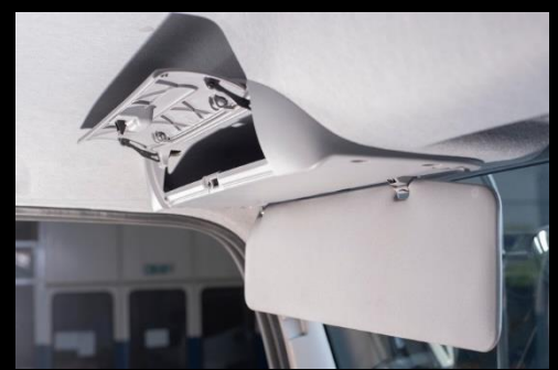
Covered overhead shelf

Allow confirmation of a vehicle status at a glance