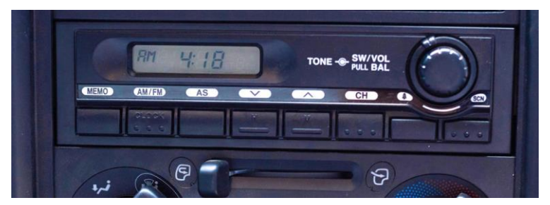
AM/FM radio with CD player Produce superior sound quality